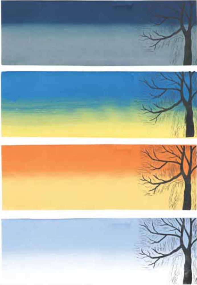
Amy Fossum A Window of Seasons

2009, screenprint with linocut, acrylic, and oil ink on rives BFK, 27 inches x 36 inches