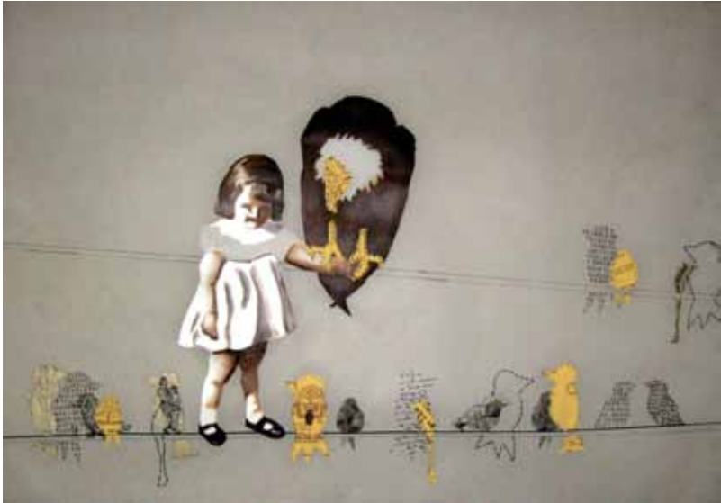
Beth VanDerMolen '07 I Walk the Line

2009, mixed media on mylar, 58 inches x 40 inches