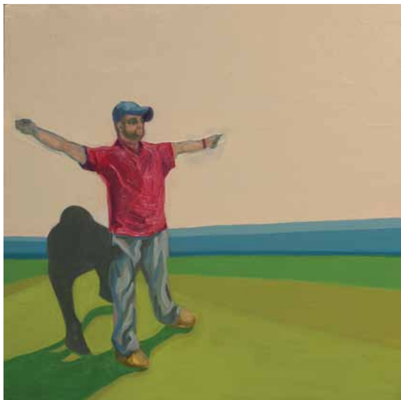
Tien Chang '08 CTRL No. 3 "Search"

2009, oil on canvas, 24 inches x 24 inches