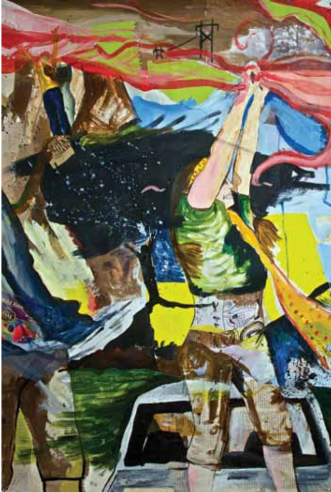
Sarah Wurst Listen Wind

2009, mixed media on paper, 22 inches x 30 inches