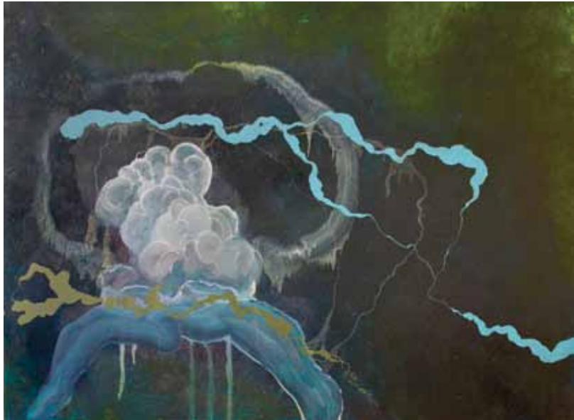
Eric Tuftee '08 M-16

2008, oil on board, 36 inches x 30 inches